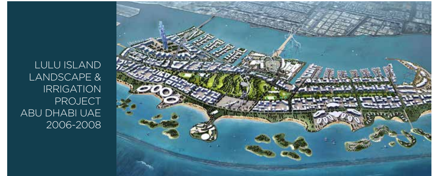
LULU ISLAND LANDSCAPE & IRRIGATION PROJECT ABU DHABI UAE 2006-2008