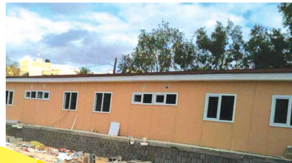
MUSIRATA HOSPITAL SITE OFFICES PROJECT