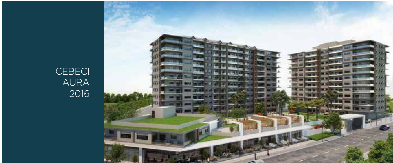
CEBECI AURA 2016