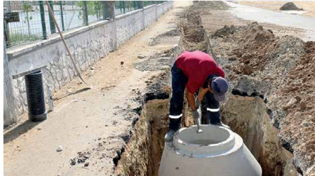
ASPHALT CONSTRUCTION WORK