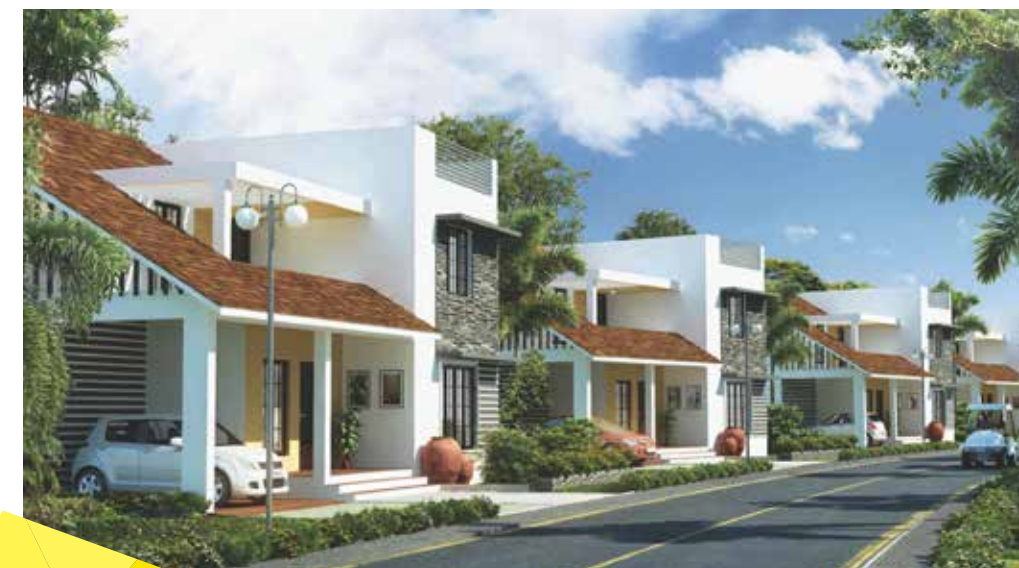
ERBIL LIME LIGHT HOUSING PROJECT 1000 VILLAS ERBIL IRAQ 2010-2011