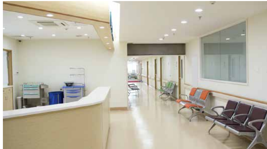
İZMİR HOSPITAL 2019