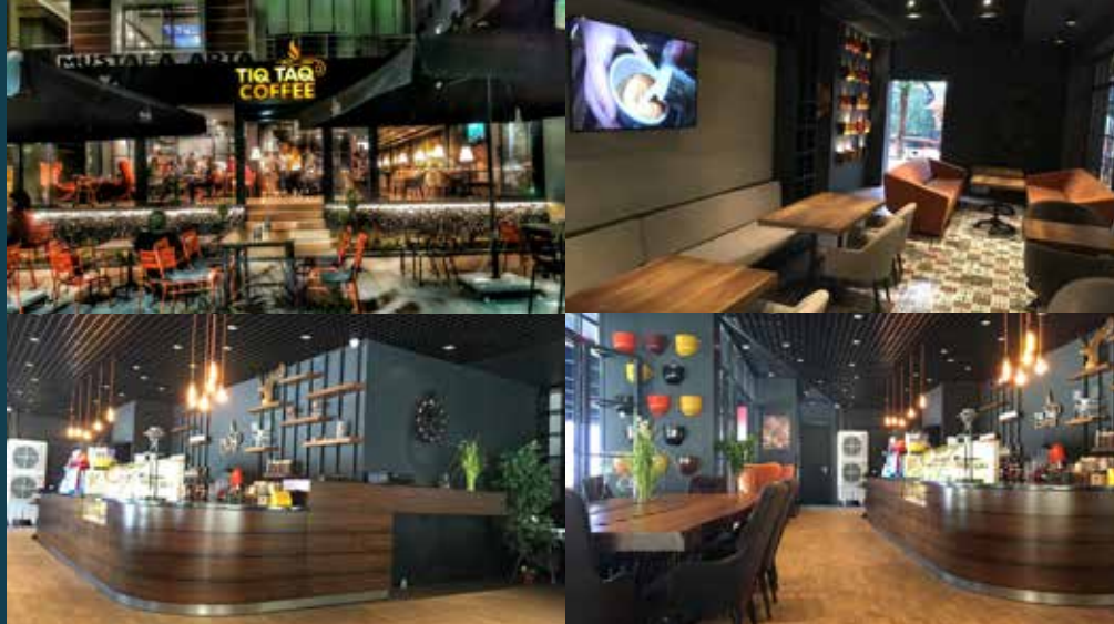
TIQTAQ COFFEE İZMİR 2019