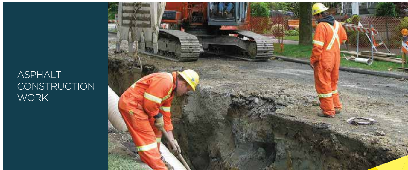
ASPHALT CONSTRUCTION WORK