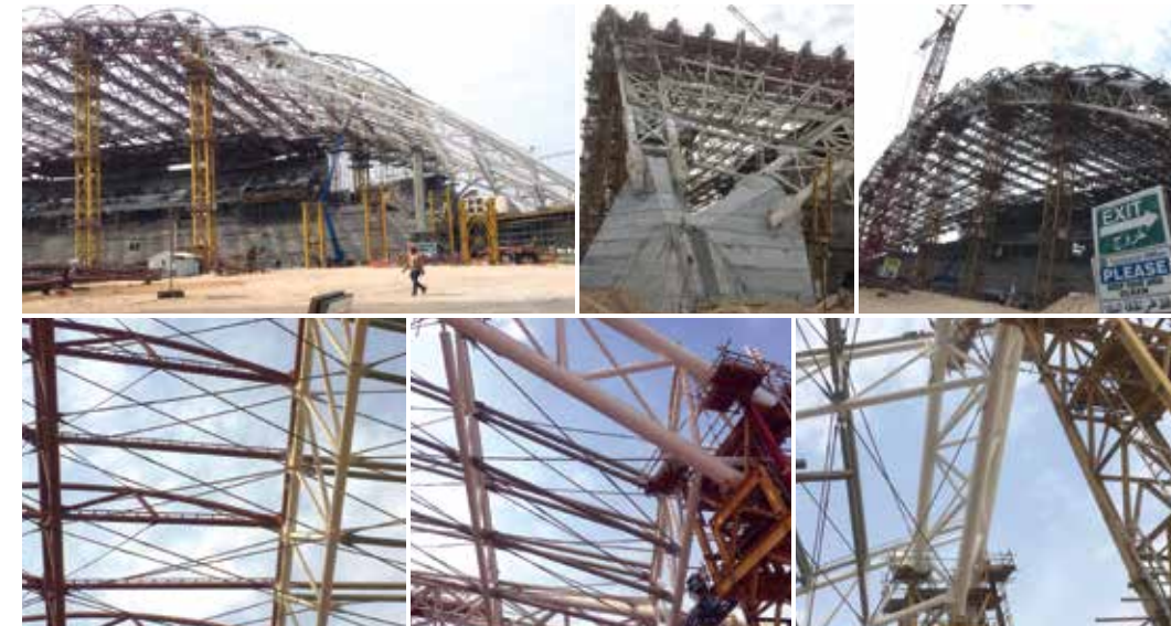
KUWAIT UNIVERSITY STUDENTS ACTIVITIES & ATHLETIC FACILITIES 2019