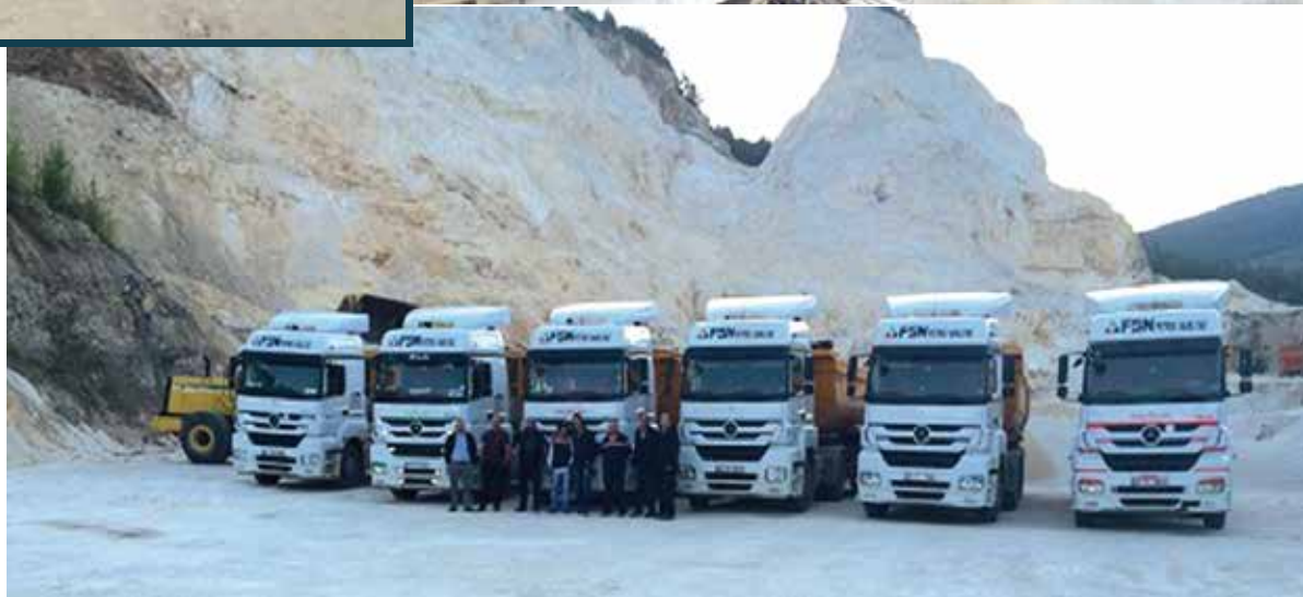
30.000.000 TON CAPACITY SUPPLY AGGREGATE