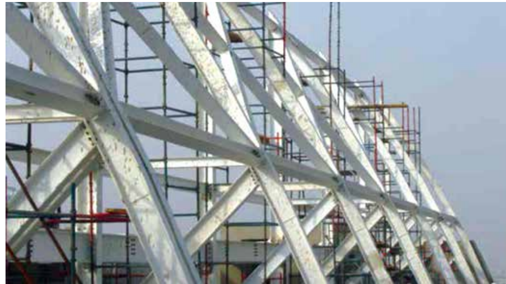
KUWAIT OIL TANKER COMPANY MAIN OFFICE BUILDING 2009