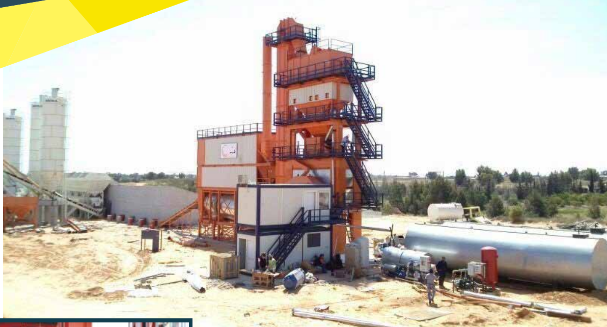
240 TON/HOUR ASPHALT PLANT - TRIPOLI/LIBYA 2011