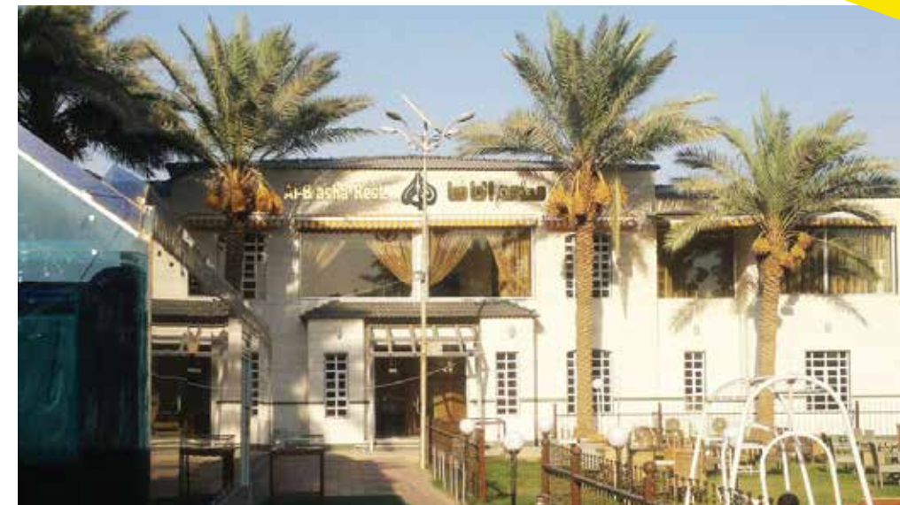
HUNTING CLUB BAGHDAD 2010