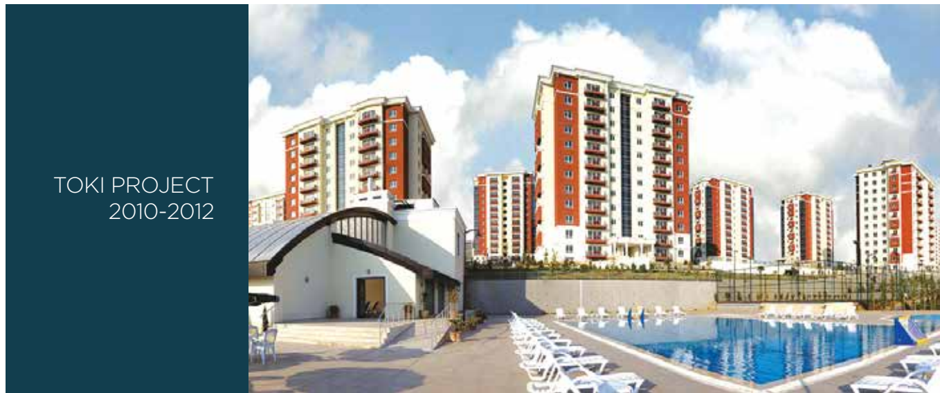
TOKI PROJECT 2010-2012