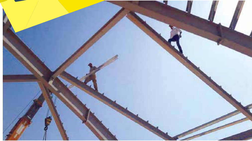
TRIPOLI WEDDING COMPLEX 2014