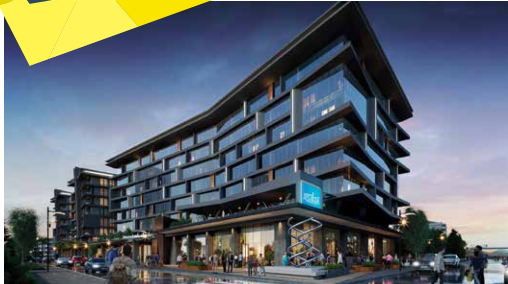
AVCILAR RESIDENCE 2015