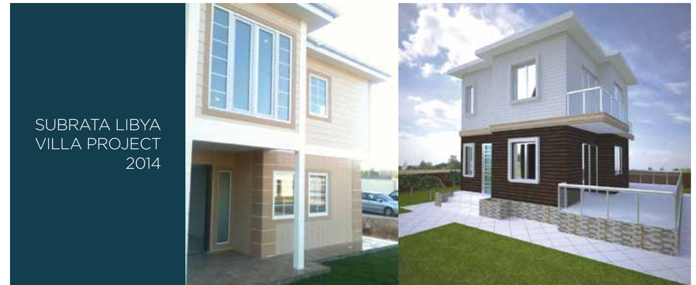
SUBRATA LIBYA VILLA PROJECT 2014