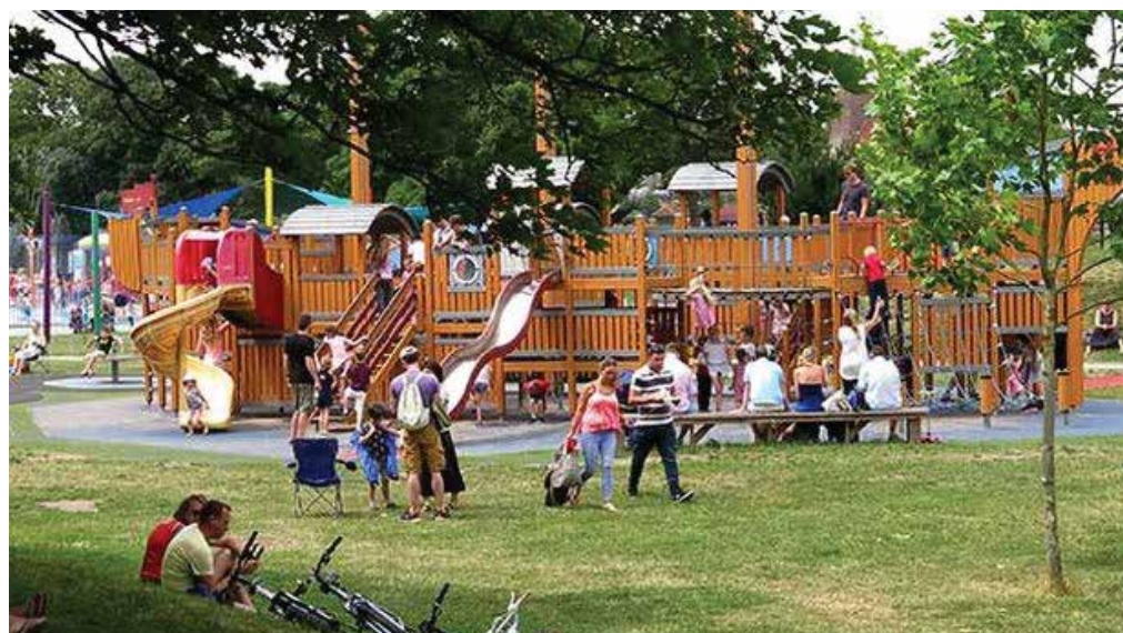
DARICA PARK LANDSCAPE PROJECT 2010-2012