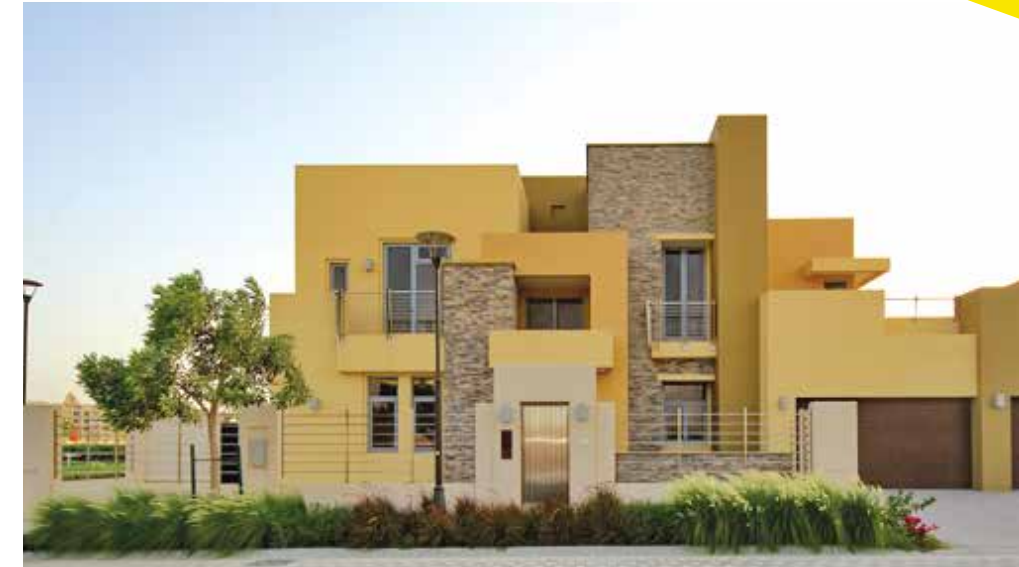
FIRST GULF BANK HOUSES ABU DHABI 2004-2008