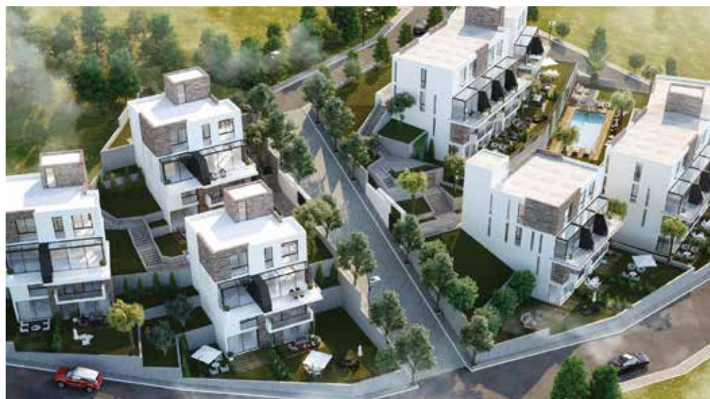
WEST LIFE 2017