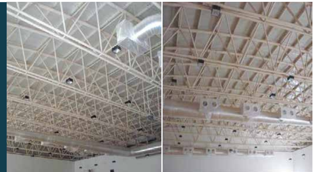
COLLEGE OF BASIC EDUCATION GIRLS CAMPUS 2010